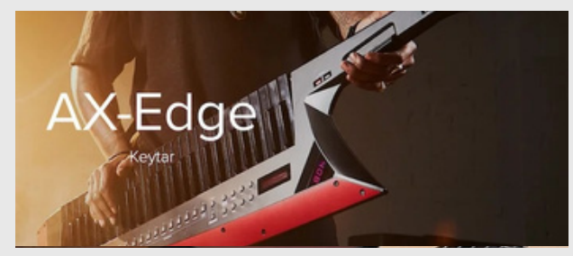
Roland AX-EDGE Keytar Make your synth solo the spotlight.

This white beauty from Roland lets you move like a rockstar while playing like a classical pro.