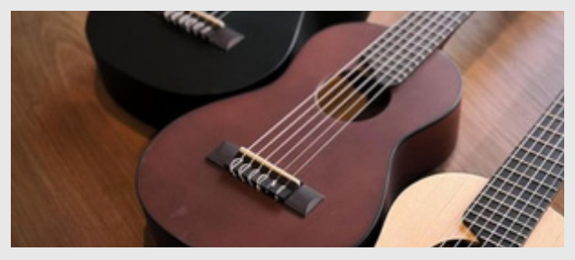
Yamaha GL1 Guitalele Small guitar. Big vibe.

This portable Guitalele (Guitar + Ukulele) combo is ideal for backpackers, students, and cafe gigs.